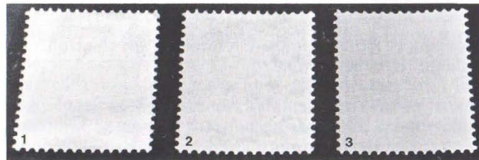
The three types of gum: 1. G.A., 2. P.V.A., 3. P.V.A.D.

sterling Machin definitives, and the fluorescent coated paper (F.C.P.) which superseded it in late 1971 since it reacted more clearly under the Post Office ultra-violet sorters and took the printer's ink more effectively under electro-static assistance. Polyvinyl alcohol gum (P.V.A.) was used for all stamps when they were introduced, but gum arabic (G.A.) was used for the multi-value coil stamps which, due to pressure on time, were perforated by the Swedish rotary perforator which was unsatisfactory with the polyvinyl alcohol gum. However, this perforator had to be used to maintain supplies of perforated sheets and so remaining stocks of gum arabic were used to produce ½p, 2½p, 3p, 4p and 6p values.