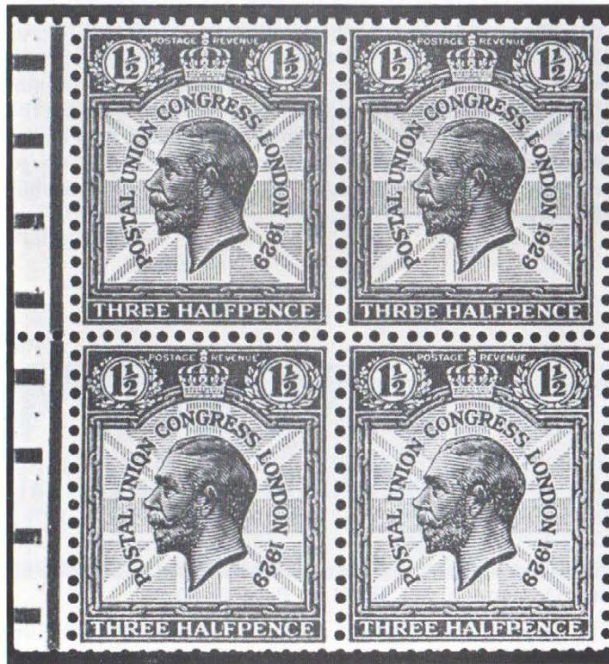
P.U.C. 1½d pane with inverted wmk. showing the 'Q for O' variety on stamp No. 4.

As this pane with upright watermark is now appearing in auction at over the £300 mark, it is very relevant to collectors of G.B. booklet panes as to the relative value of the inverted pane to the upright pane.